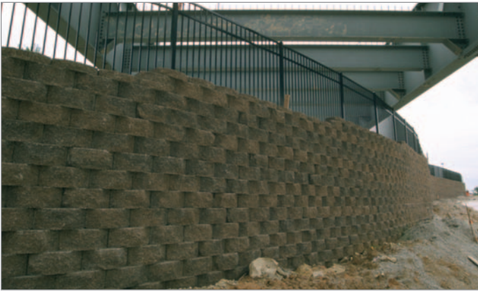
Keystone Compac Tri-plane units were utilized to build this pedestrian walkway.